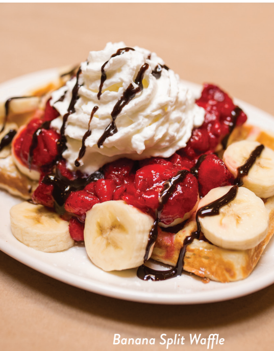
Banana Split Waffle

COCONUT CREAM PIE WAFFLE $10.99 Sliced bananas with vanilla custard and topped with dairy fresh whipped cream and toasted coconut.