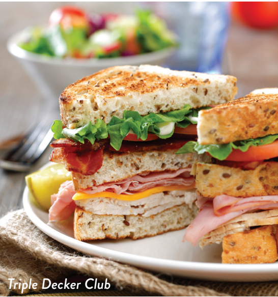
Triple Decker Club

SLICED STEAK CIABATTA $13.99 Tender steak slices with sauteed mushrooms, onions and green peppers stacked on a warm ciabatta bun with cheddar cheese and garlic aoli.