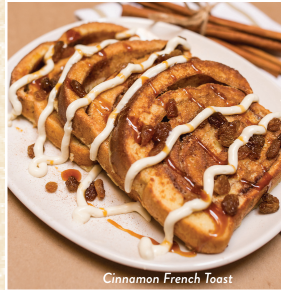
Cinnamon French Toast

FRENCH TOAST COMBO $11.99 Four French toast wedges served with two eggs, two slices of bacon and home-style hash browns.