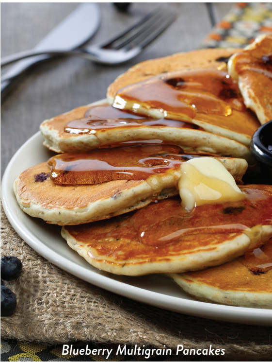
Blueberry Multigrain Pancakes

BLUEBERRY MULTIGRAIN $9.99 POTATO PANCAKES $9.99 Hearty multigrain pancakes loaded with blueberries and dusted with icing sugar. Served with warm blueberry compote. With two strips of bacon. $10.99