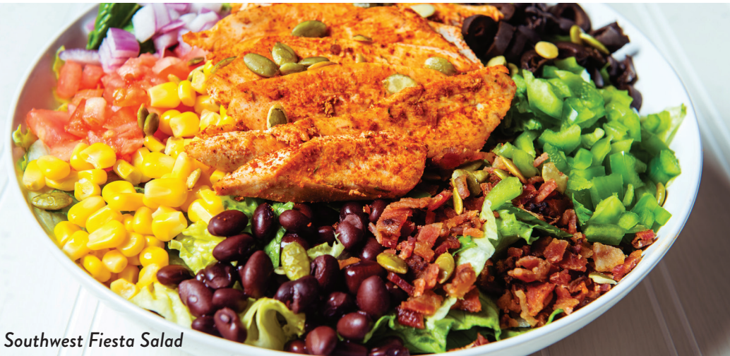
Southwest Fiesta Salad

All salads (except Taco) are served with a slice of garlic toast.