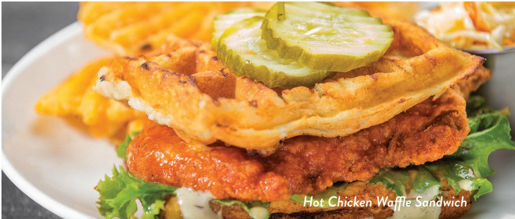
Hot Chicken Waffle Sandwich