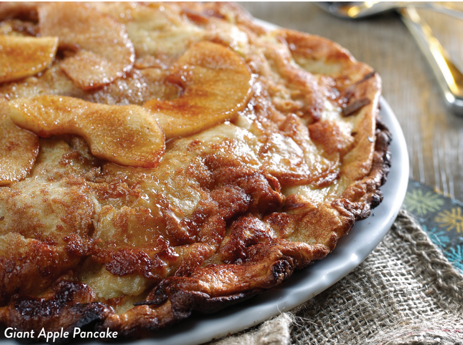
Giant Apple Pancake

Add chocolate chips to any order of pancakes for $1